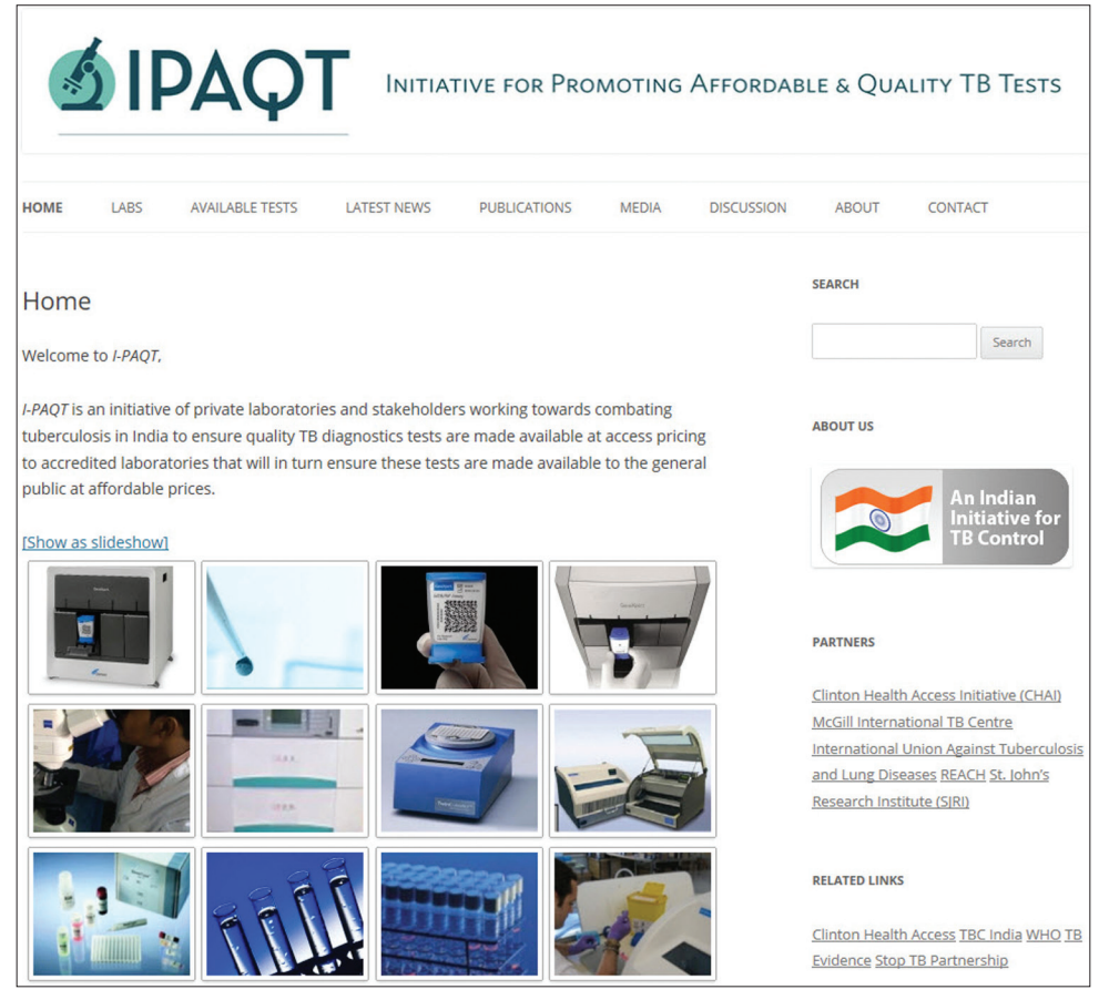
Figure 2: Web site of the initiative for promoting affordable, quality TB tests initiative (www.ipaqt.org)

Since its launch in March of 2013, the IPAQT initiative has already achieved a pan-India presence-with 42 labs which encompasses over 3000 franchisee labs and greater than 10,000 collection centers committed to providing these tests at affordable prices [Figure 2]. The number of labs is expected to increase significantly in the